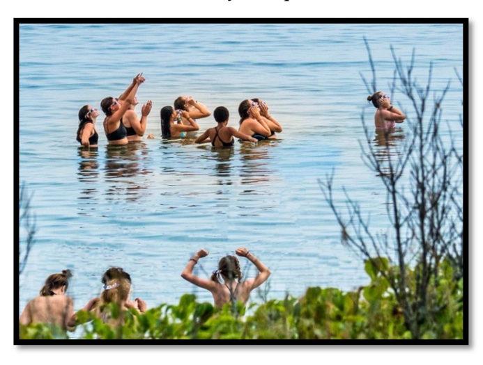
Can you guess where this "cool spot" is in Newport Wilderness Park?