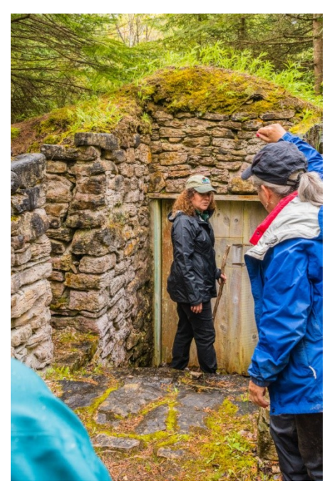
Hike and Newport History.