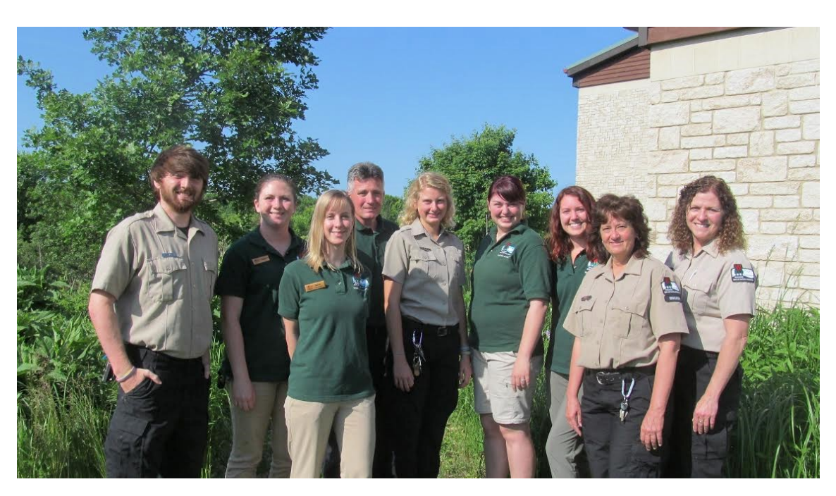
Training for Northeast Region Naturalists