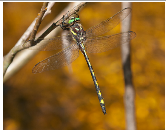
Arrowhead Spiketail Dragonfly