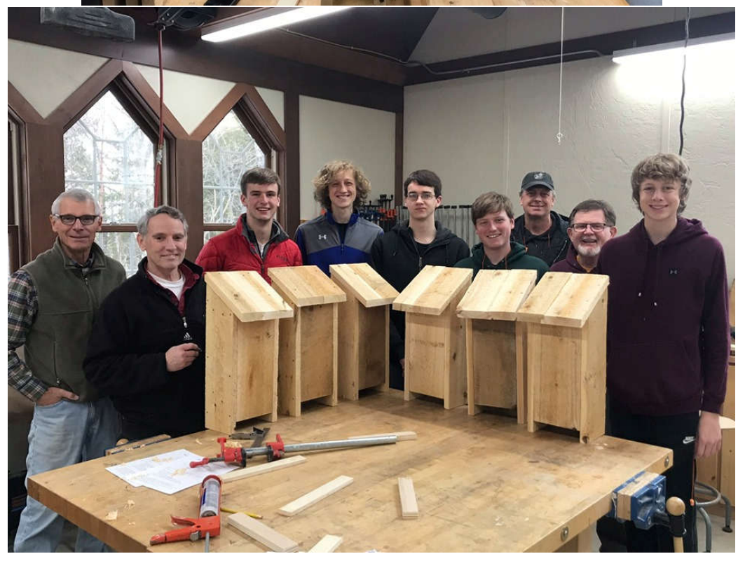
Job Well Done!!!!