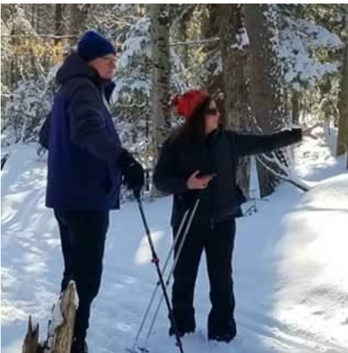
Winter snowshoe class

February 8 th Candlelight Ski, 5:30 - 8:30