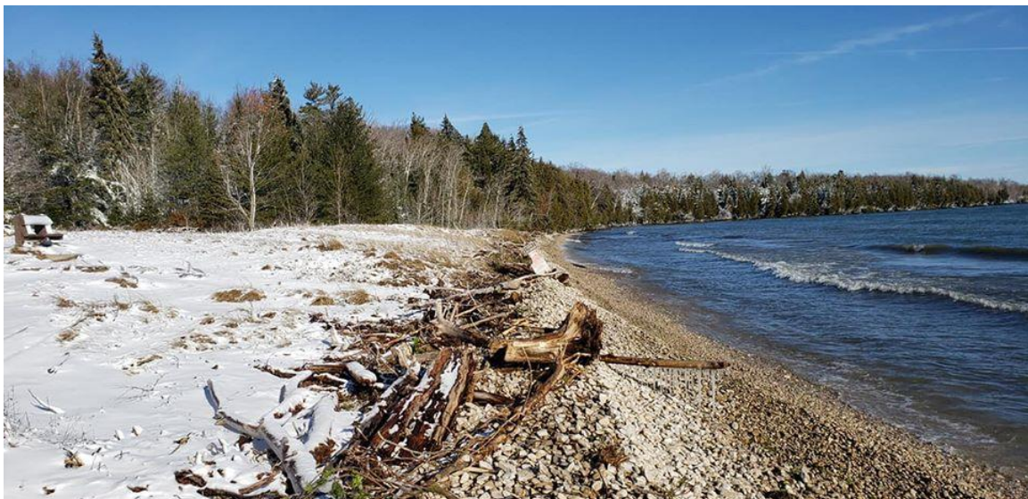
Newport Beach looking north - December 1, 2019