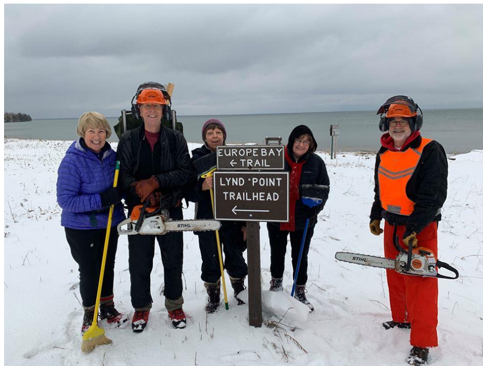
Some of our hardy volunteers!