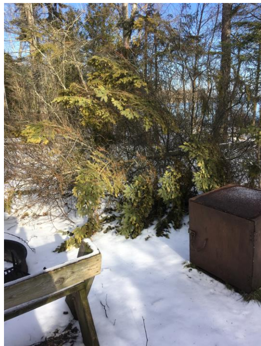
Trail and camp site damage