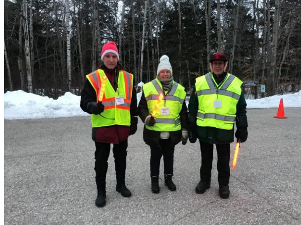
Parking and greeter volunteers