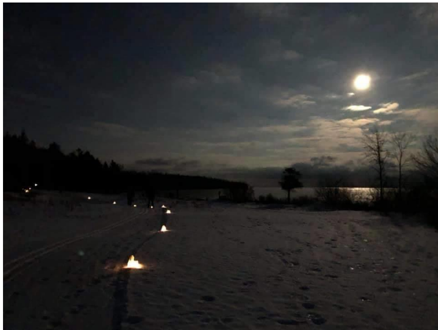
A gorgeous shot of our Candlelight Ski/hike