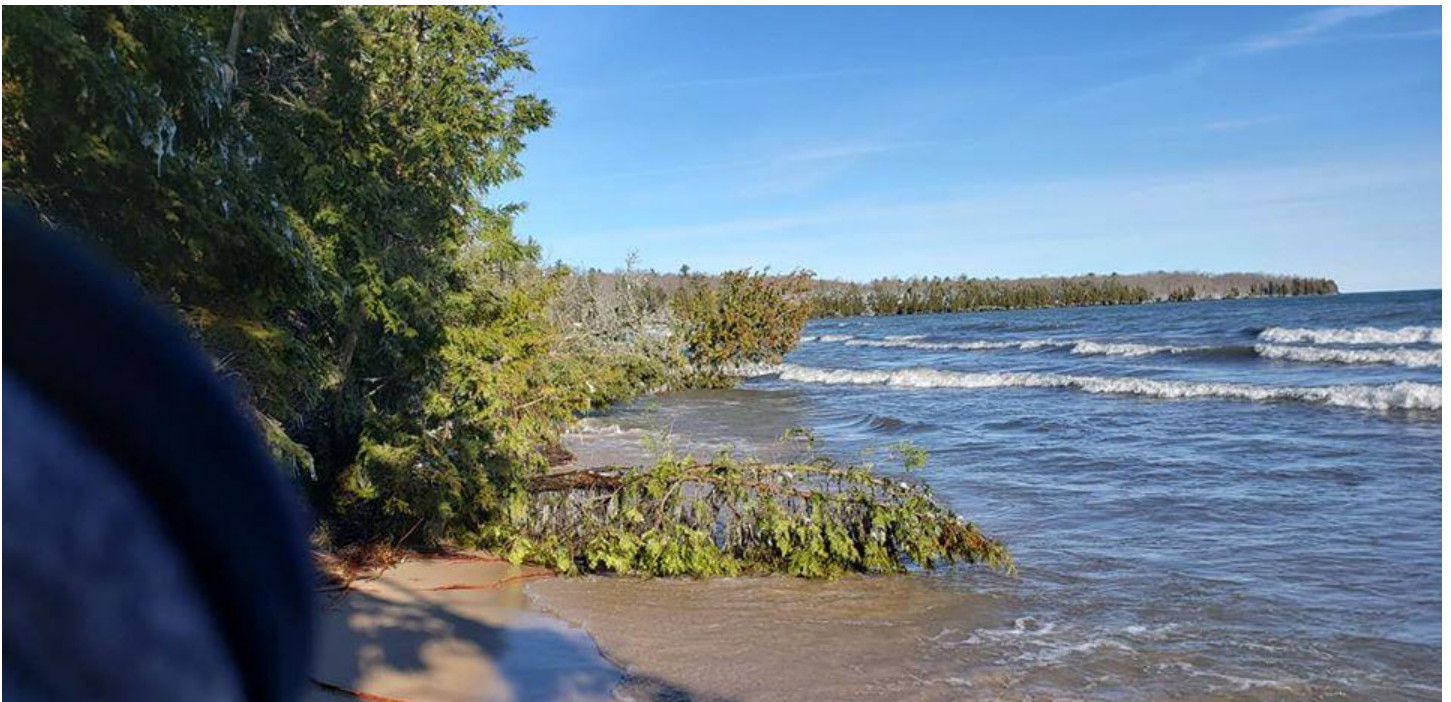
Lot 2 beach, after December 1 st snowstorm