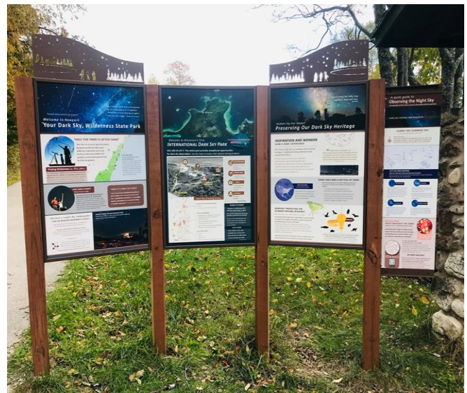
Dark Sky Park Kiosk, Lot 3