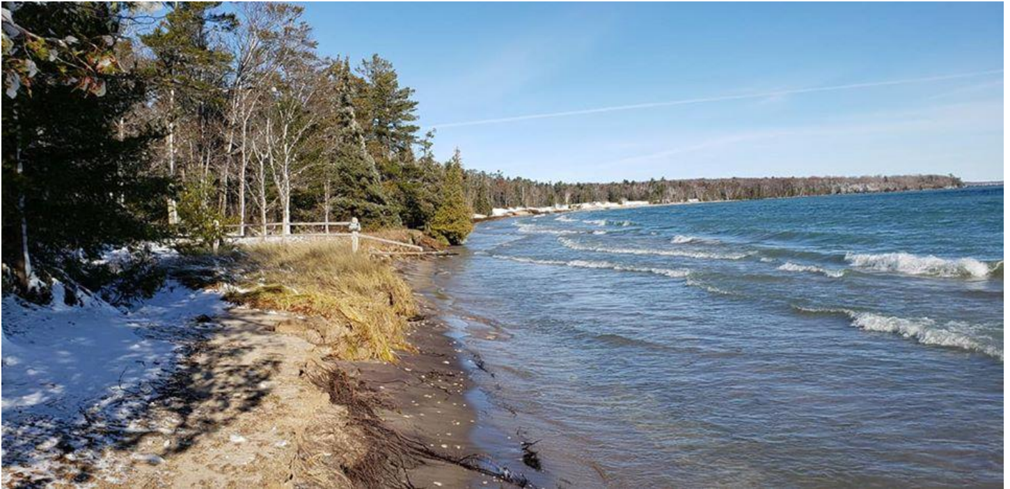
Europe Bay beach, after December 1 st snowstorm