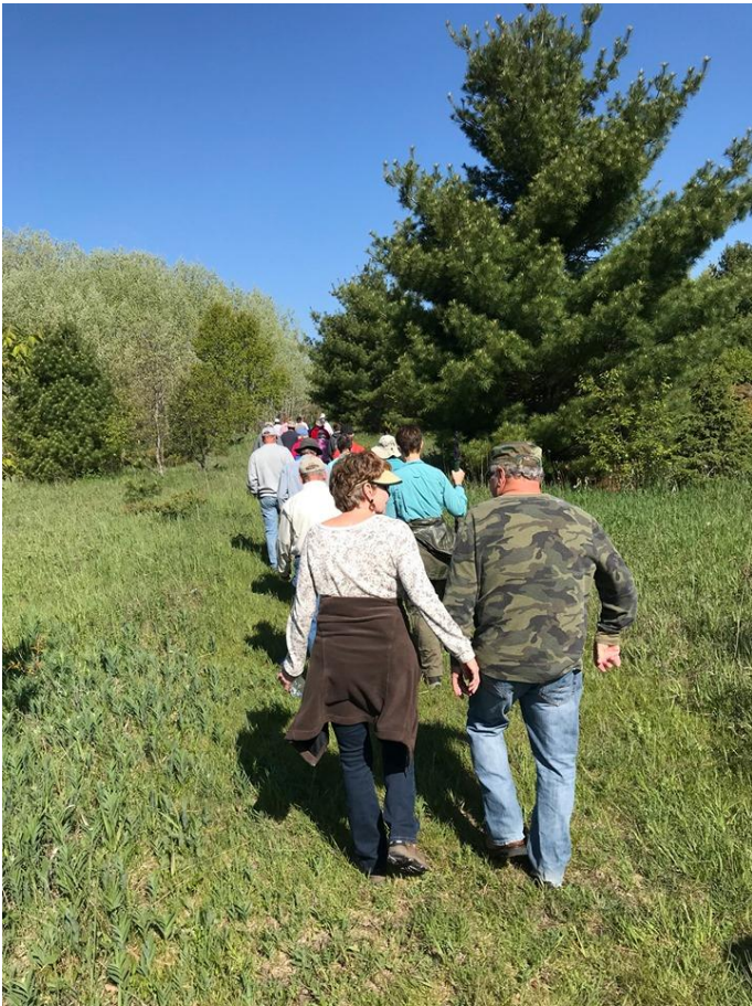
OutWiGo Challenge Hikes will be back this summer