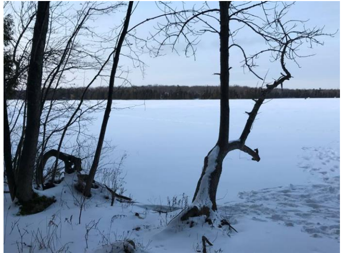
Europe Lake, 2019