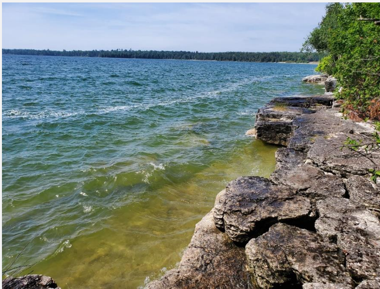
Beautiful Lynd Point with Lake Michigan at record level highs.