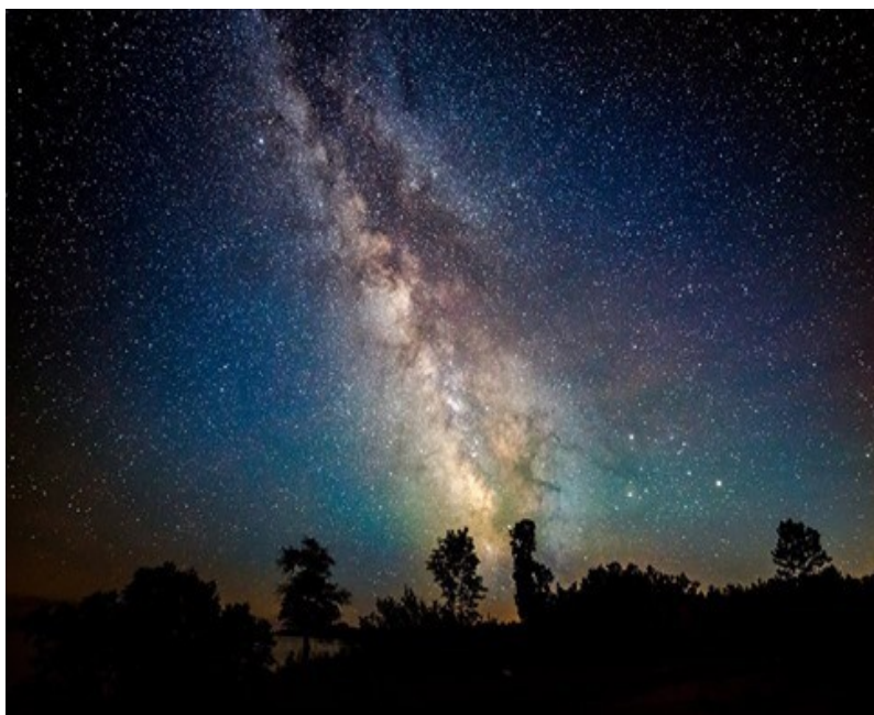
"Southern Skies Over Newport" by Denny Moutray