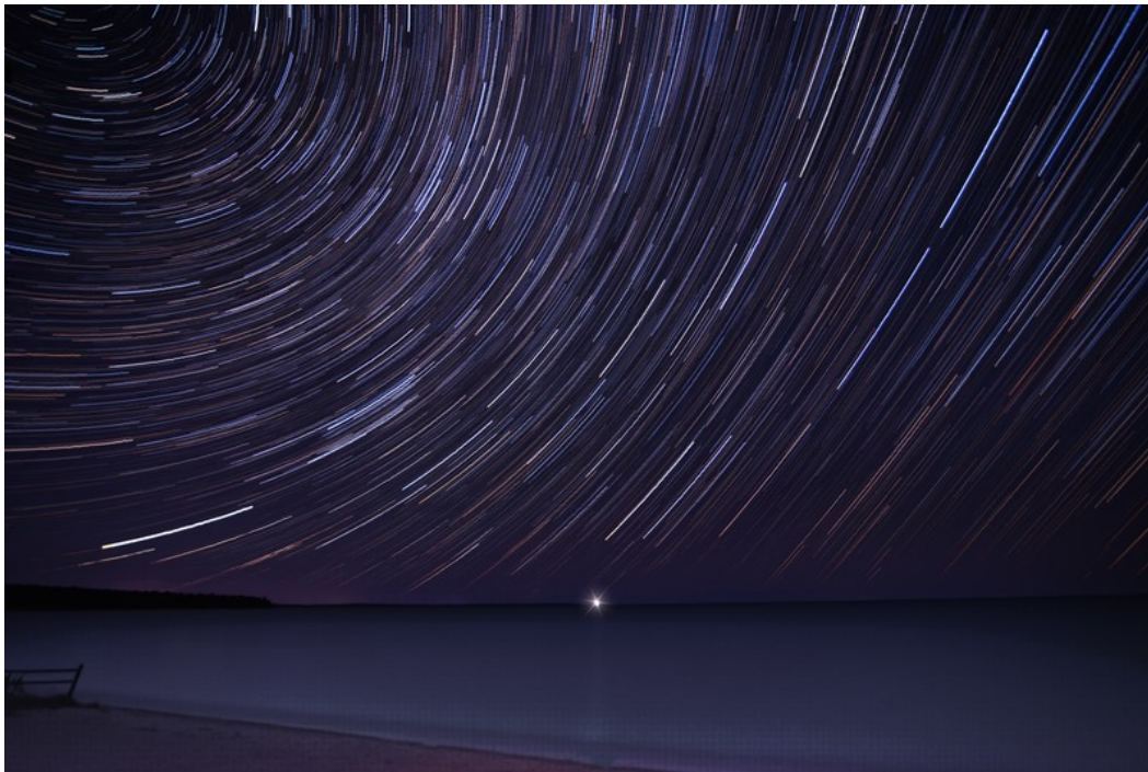
Star trails at Europe Bay Beach, Newport State Park. Light is a buoy in Lake Michigan

We look forward to seeing what the future brings to our Dark Sky Park up here at the top of the thumb of Wisconsin. We are encouraged by the interest of people searching for a truly dark sky to gaze at the heavens and ponder the vast universe we are all a part of. There seems to be an almost primal draw to get out and look to the sky, perhaps searching for answers to questions unknown. We live each day, knowing full well that not even the sky is the limit.