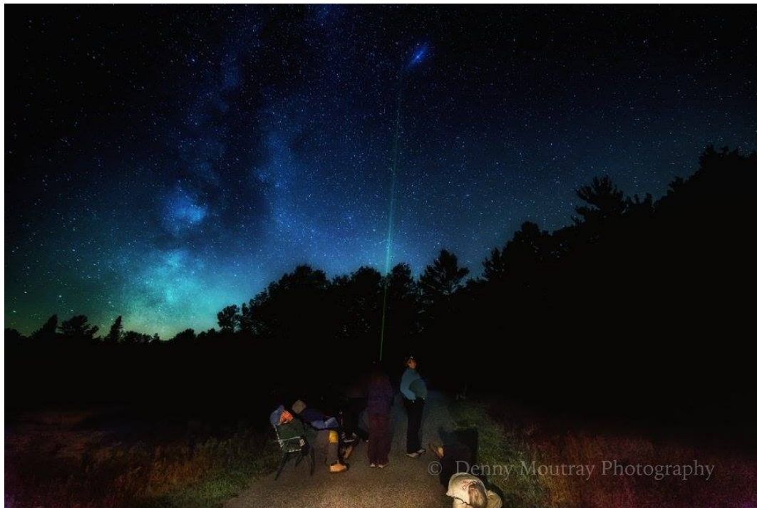
Volunteers doing a Naked Eye Limiting Magnitude Star Count, Newport State Park